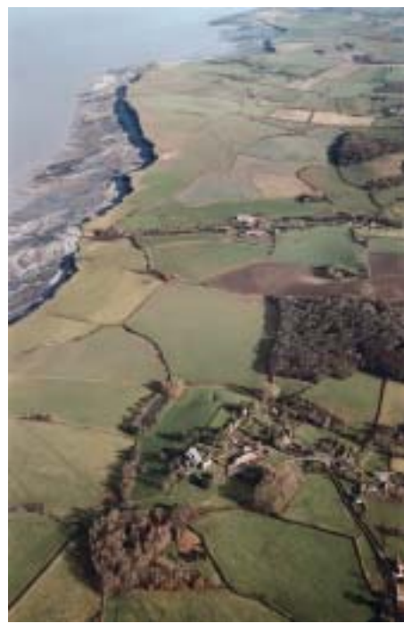
The manors of East Quantoxhead (bottom) and Kilve (centre) on the coast.

The manor house lay at the heart of the lord's estates. Both the house and its immediate environs gave opportunities for the lord of the manor to display and often flaunt his wealth and power. This is apparent on the coastal strip which borders the Quantock Hills. Here there were medieval manor houses at West and East Quantoxhead, Kilve and Kilton. The estates had access to the coast as well as good farmland and large areas of upland grazing on the heath. The most favoured spot for the manor house was close to the sea and each house had a deer park, providing both food for the household and sport for the lord and his party. The deer parks were laid out for the most part on ground close to the manor houses and contained areas of woodland and wood pasture as well as more open ground. The remnants of these woody landscapes can be seen at East Wood, East Quantoxhead and Kilton Park Wood, Kilton. By this time, the pattern of landuse and settlement on the hills was similar to that of today. The open heath was common land, with settlements at the foot of the combes, giving access to a wide variety of land types, such as upland pasture, woods, meadow and arable fields.