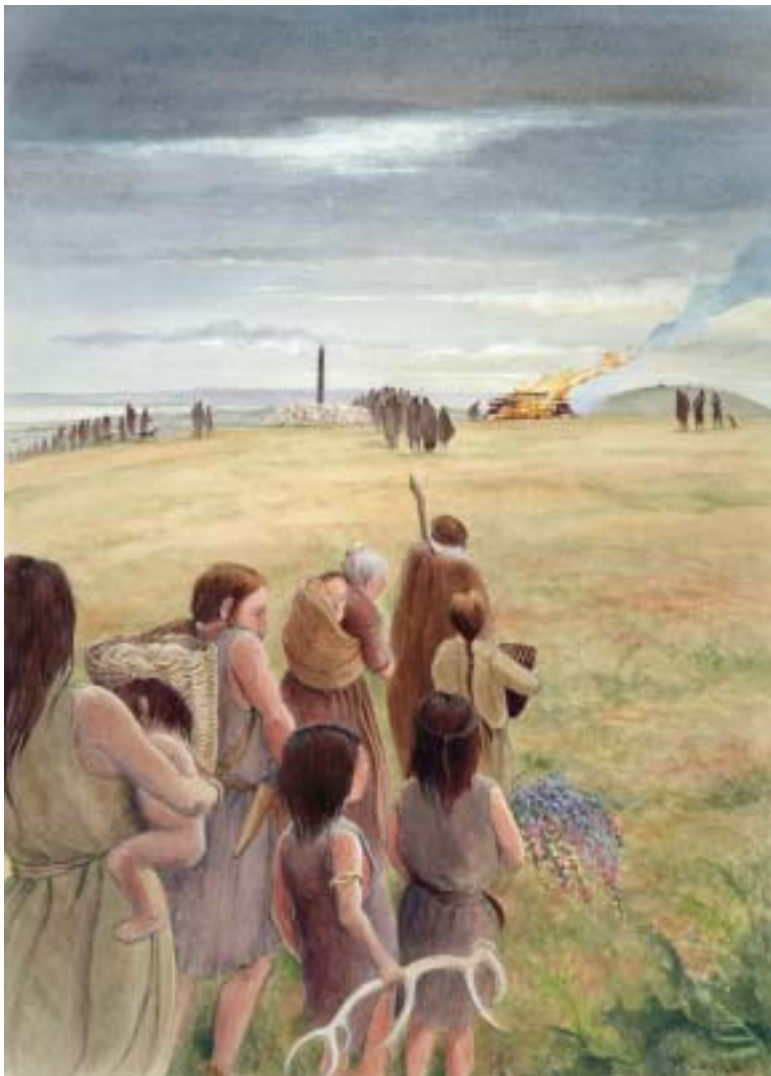
Re-creation of a Bronze Age burial ceremony at the platform cairn on Higher Hare Knap.