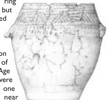
The Broomfield urn. (Elaine Jamieson)