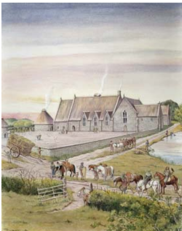
Re-creation of the manor house at Kilve in the early 14th century. (© Jane Brayne)