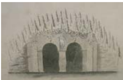
The grotto at Terhill Park, shown on an 18th-century map.

In the post-medieval period, formal gardens and ornamental landscape parks were laid out, and many of the old medieval manor houses were rebuilt or refurbished on a grand scale. Court House, East Quantoxhead, was given a new frontage in the early 17th century and Cothelstone Manor was rebuilt, probably on a new site, with a new gatehouse and gateway, early in the post-medieval period. These new houses required new settings - formal gardens and ornamental parks. The Quantock Hills are exceptionally rich in the remains of 18th- and 19th-century designed landscapes, laid out with such vigour by the gentleman of the day.