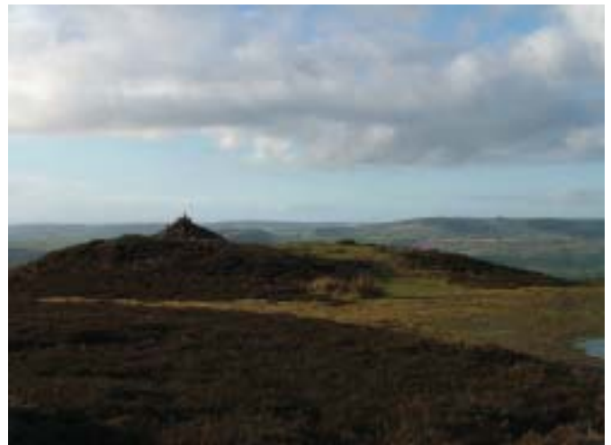
Platform cairn, Hurley Beacon

Stand anywhere on the open heath of the Quantock Hills and you will never be far from a Bronze Age barrow or cairn.