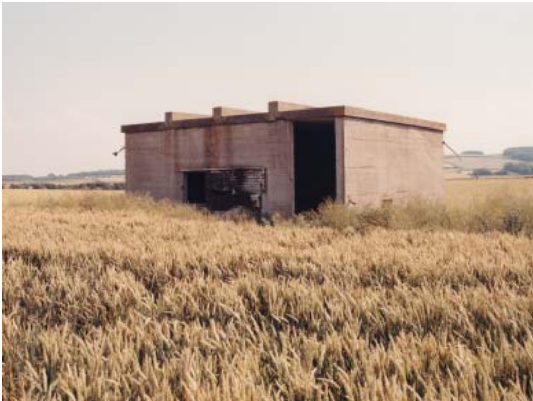
The blast-proof shelter on the coast north of Kilton. (AA053024)

The Quantock Hills became the temporary home for troops from north America and many Italian and German PoWs during the Second World War, with large camps at Crowcombe Heathfield and Goathurst.