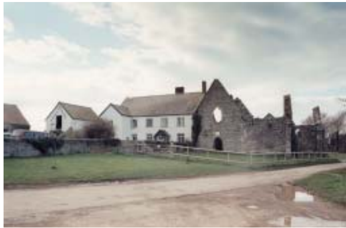
Kilve in the early 21st century. (AA 048499)

The evidence for the medieval landscape of the Quantock Hills is rich and diverse. The wealth of the landowning families is reflected in the surviving medieval fabric of churches, chapels and manor houses. At Kilve a substantial part of the late 13th- or early 14th-century manor house still stands. The evidence