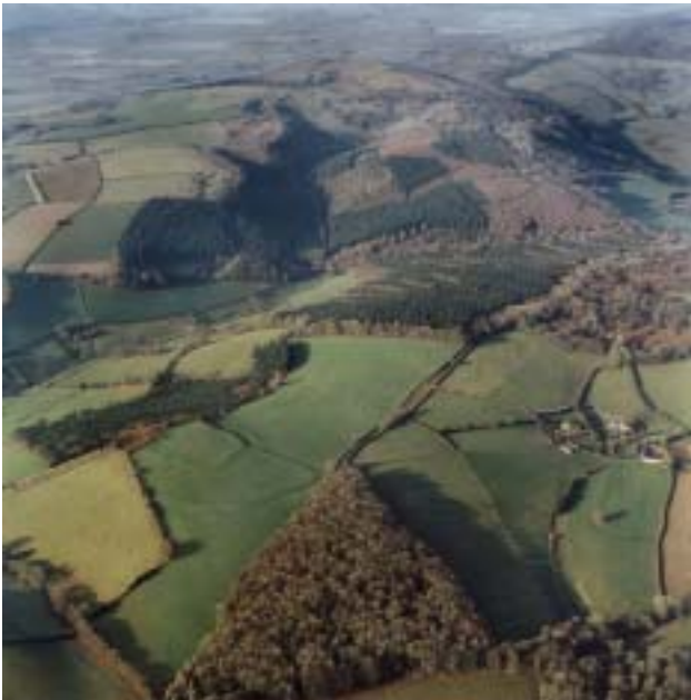
The ploughed over enclosures at Higher Castles (bottom left).

The Quantock Hills contain a large number of enclosures which date from the later Bronze Age, the Iron Age and Roman periods. Some of these enclosures are the well known hillforts which survive as earthworks at Dowsborough Camp and Ruborough Camp. As well as functioning as places of refuge in times of stress, the investment in labour required to construct the hillfort earthworks meant that they were also symbols of power and prestige. Many of the smaller enclosures were settlements, containing houses and agricultural buildings, or stock enclosures, others were concerned with ritual. The large numbers of sites which survive on the southern