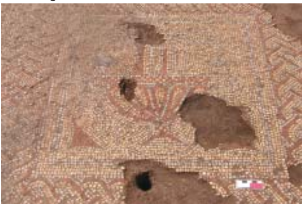
The central part of the Roman mosaic at Yarford.

edge of the Quantock Hills, around Broomfield and Kingston St Mary, both as earthworks and as cropmarks, visible on air photographs, show that the landscape was well-populated here by the end of the first millennium BC. The people who lived and worked on the hills were self-sufficient farmers who kept cattle, sheep and pigs and grew arable crops. Some were craftsmen, specialists in making pottery, jewellery, or iron tools. The presence of small deposits of iron and copper ore in the area around Broomfield and Kingston St Mary, the fertile south-facing slopes and the fast-flowing streams which drain the combs made the southern edge of the Quantock Hills attractive to Iron Age and Roman farmers.