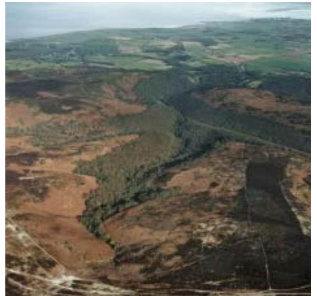
Open heath gives way to woodland on Black Ball Hill and Slaughterhouse Combe. (NMR 2195/07)

The post-medieval landscape is one of contrasts. The tranquil landscape which inspired the Romantic poets Coleridge and Wordsworth was also a working landscape.