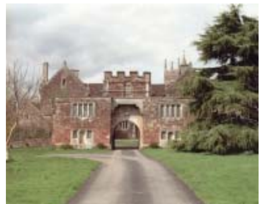
The gatehouse at Cothelstone Manor. (AA048455)

The oak woods were home to woodsmen and charcoal burners, and the fields around Dodington, not far from the Wordsworths' Quantock home at Alfoxton, were the scene of copper mining in the 18th and 19th centuries. The open heath still preserves the plough ridges of relict field systems, testament to a time when rye was cultivated on parts of the hills every 10 or 15 years. Rural industries grew up in the villages along the edge of the hills, using