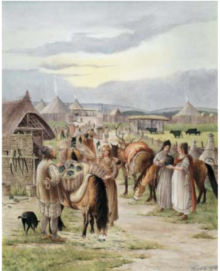
Life in the Iron Age at Higher Castles, Broomfield.

edge of the Quantock Hills, around Broomfield and Kingston St Mary, both as earthworks and as cropmarks, visible on air photographs, show that the landscape was well-populated here by the end of the first millennium BC. The people who lived and worked on the hills were self-sufficient farmers who kept cattle, sheep and pigs and grew arable crops. Some were craftsmen, specialists in making pottery, jewellery, or iron tools. The presence of small deposits of iron and copper ore in the area around Broomfield and Kingston St Mary, the fertile south-facing slopes and the fast-flowing streams which drain the combs made the southern edge of the Quantock Hills attractive to Iron Age and Roman farmers.