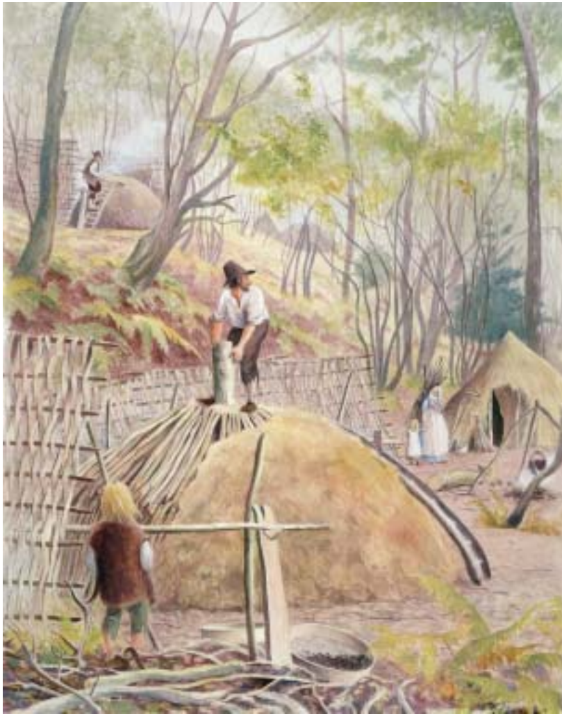
Charcoal burners at work in Slaughterhouse Combe. (© Jane Brayne)

agricultural products, raw materials from the woods, and water for power and processing. There were tanneries at Holford, Nether Stowey and Crowcombe, and textile manufacture at Holford and Marsh Mills.